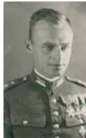
Captain Witold Pilecki

Based on Pilecki's most comprehensive report about his Auschwitz mission, which was published in English for the first time by Aquila Polonica as the award-winning book The Auschwitz Volunteer: Beyond Bravery .