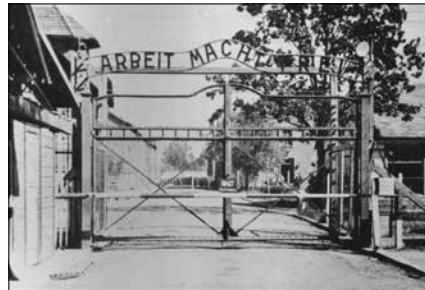
The main gate at Auschwitz: "Arbeit macht frei" ("Work liberates you")