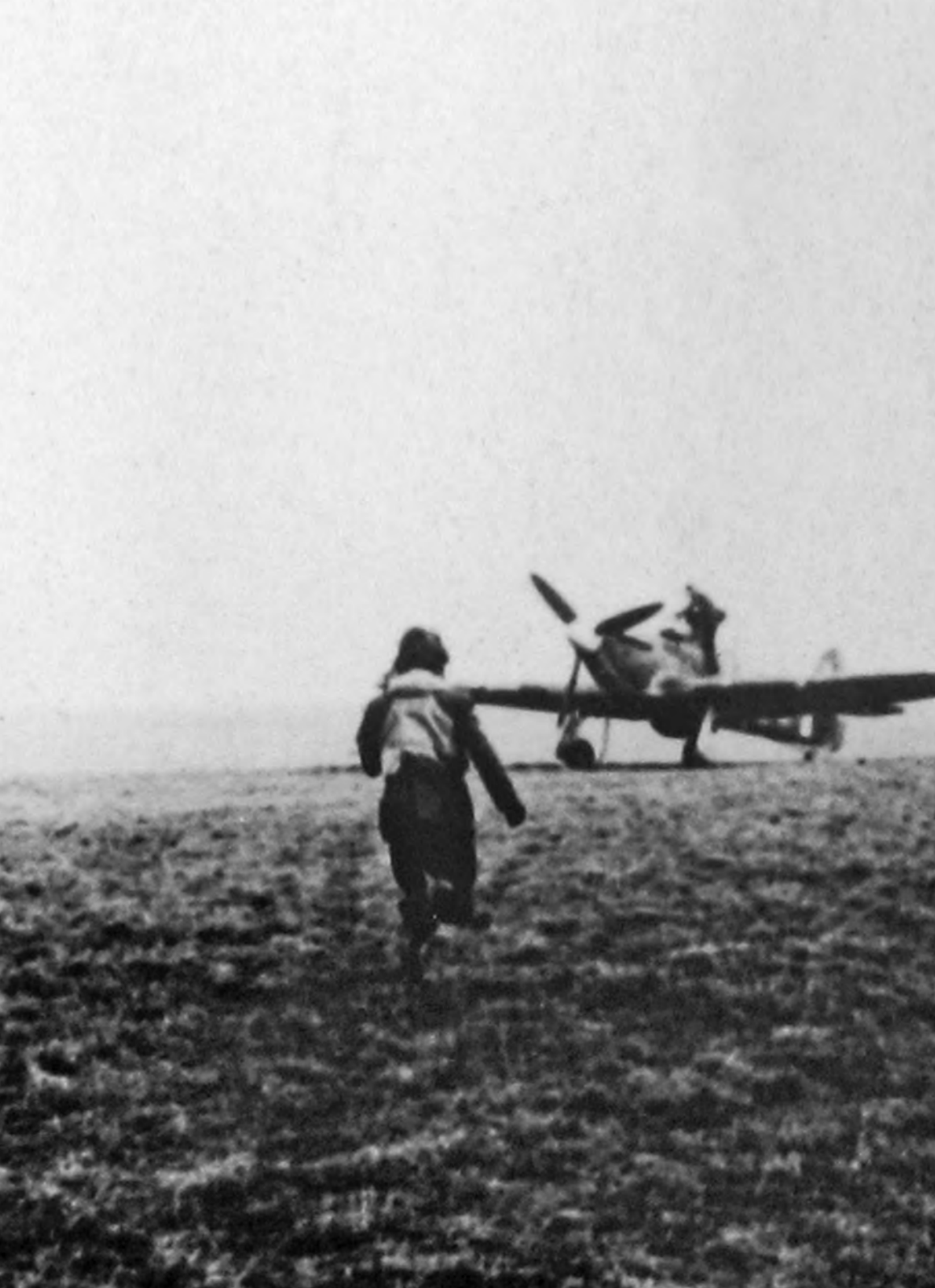
Excerpted from "303 Squadron: The Legendary Battle of Britain Fighter Squadron" by Brian Fiedler, Coping Press, London, Polonica (U.S.) Ltd.