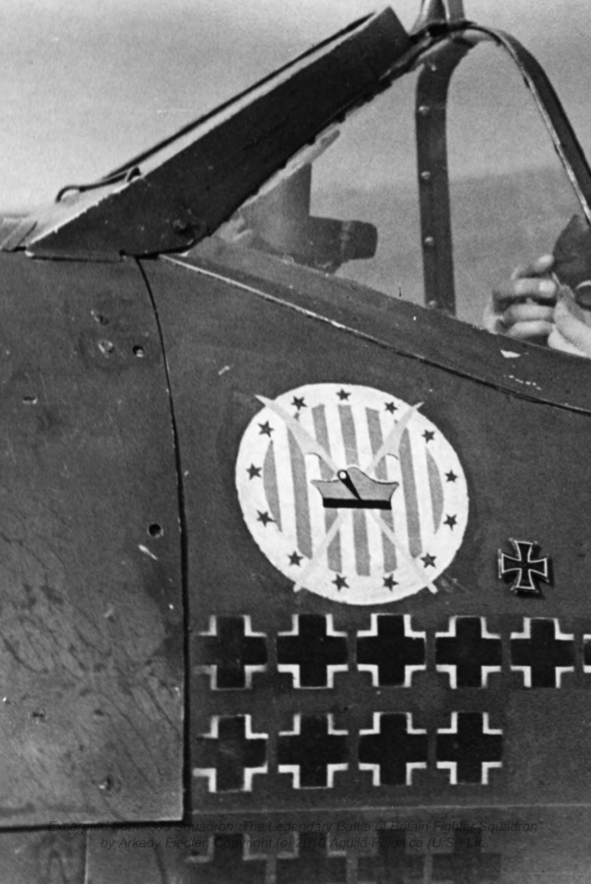
Excerpted from "503 Squadron: The Legendary Battle of Britain Fighter Squadron" by Arkady Fiedler. Copyright (c) 2010 Aquila Polonica (U.S.) Ltd.