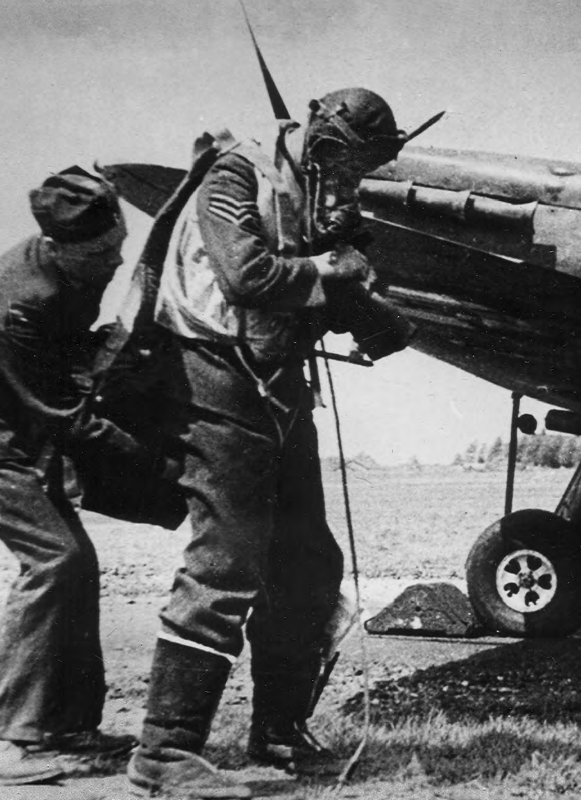
Excerpted from "303 Squadron: The Legendary Battle of Britain Fighter Squadron" by Arkady Fiedler, Copyright (c) 2010 Aquila Polonica (U.S.) Ltd.